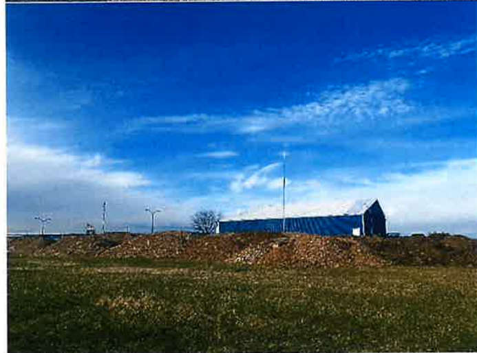
Un-stabilized construction activity with no BMPs in place.