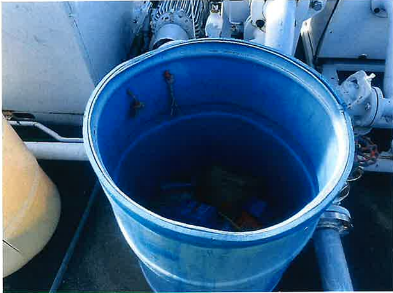
Barrel uncovered at fuel farm.