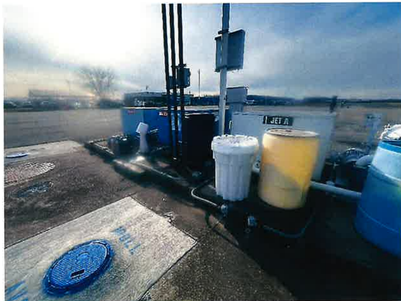
Yellow barrel at fuel farm with crack.