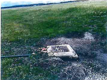
System #2 infield drain covered