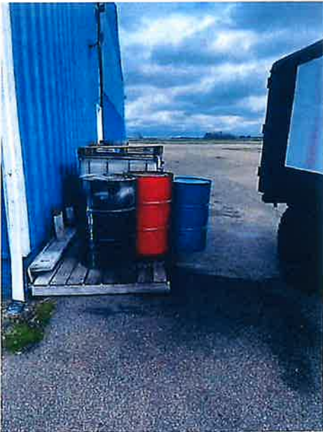
Label barrels for emergency responders