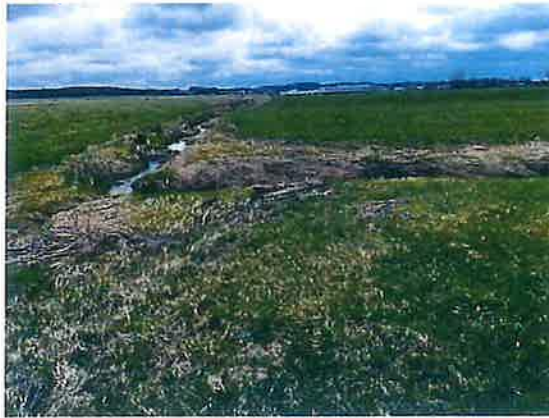
Fence post in floodway need removed