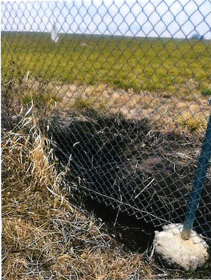
East fence tile blowout getting worse.