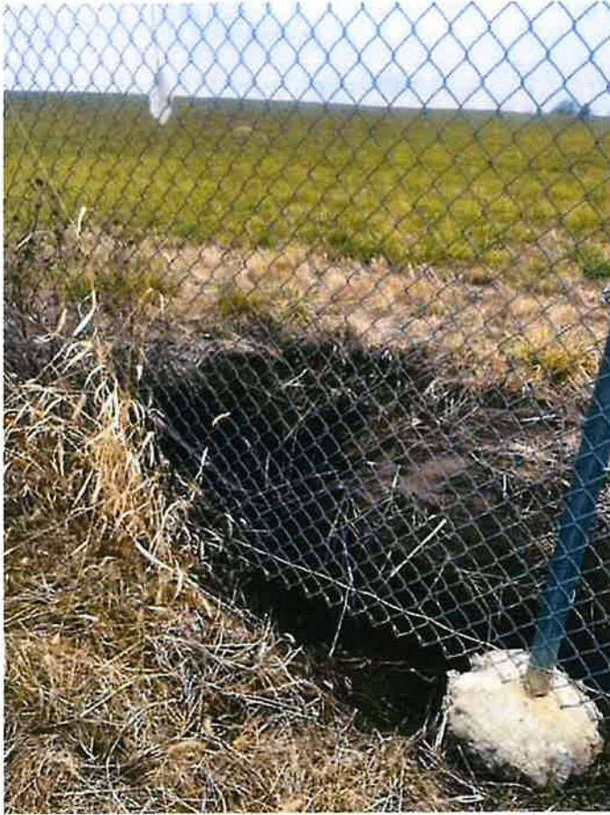
East fence tile blowout getting worse.